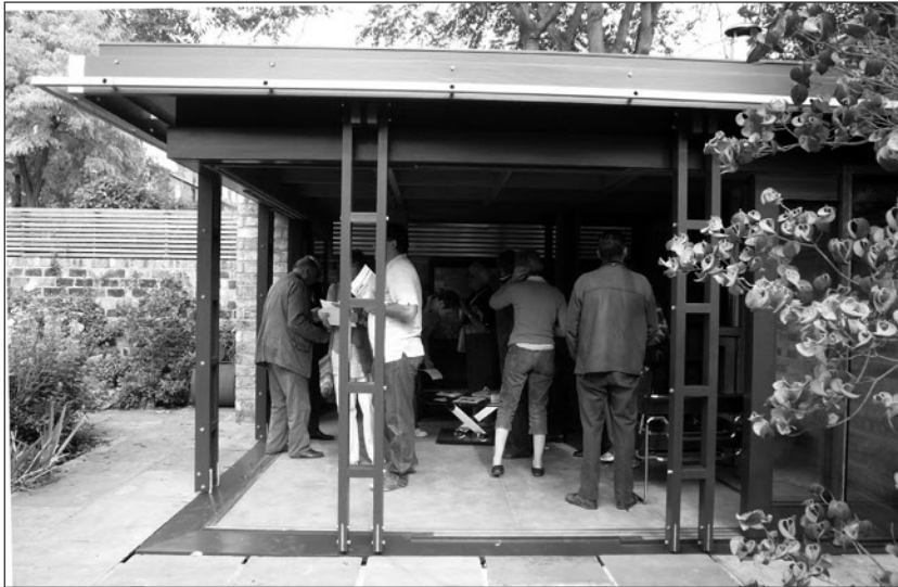
Among several interesting new buildings in Clapham which could be visited during London Open House was this unusual garden pavilion in The Chase.