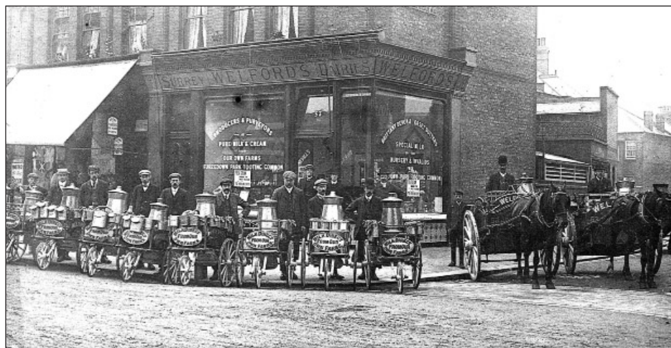
This picture of a dairy in Abbeville Road – now an estate agent – can now be seen in the new photo gallery on our website. See page 2 inside.