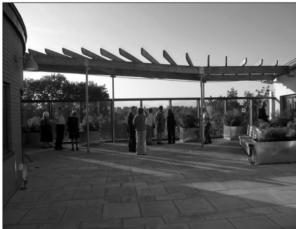
Lambeth College Sixth Form Centre – the roof terrace

Lambeth College Sixth Form Centre. Over the past few years many of our members will have watched the progress of