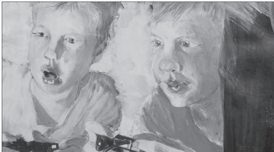
Gaming boys by Cathy Watkins

Every Friday and Saturday during May (from 12 noon to 6 pm) I am opening my studio in Rectory Grove to the public for the first time. My exhibition, called It's hero time , will feature a 10 metre long drawing and a variety of extraordinary crochet sculptures. Viewers are invited to contemplate 'the heroic' in relation to opposite ends of the age demographic. Explosive images of adolescent boys vie for attention with fluorescent woolly creations more commonly associated with the handiwork of older women. A tour de force of artistic skill and experience, the exhibition aims to inform and entertain. Come along and see for yourself at The Old Army & Navy Store, 3a Rectory Grove, SW4 0DX or find out more at cathywatkins.co.uk .