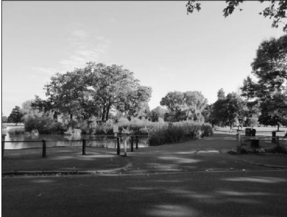
The view from Mount Pond