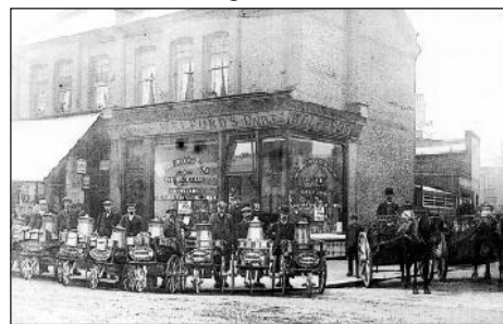
Abbeville Road as it was, with a dairy shop ready to make milk deliveries...

Have you bought your copy of this new book which shows in photographs how Clapham has changed over the years? The 'now' pictures look even better in colour! Available from Clapham Books.