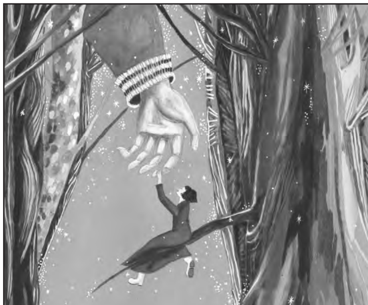
The Selfish Giant

For an unusual local Christmas present you can buy Hospice Honey from 1 December either at the café at Royal Trinity Hospice, 30 Clapham Common North Side, SW4 0RN or from Nick Pursey, telephone 020 8675 0587. It comes in 4 oz and 8 oz sizes, priced £5.50 and £10.00.