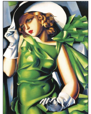
'Jeune Fille en Vert' by Tamara de Lempicka

Wednesday 15 June, 11am, Clapham Picturehouse, 76 Venn Street, SW4 0AT. Tickets: £10 visitors and non-members; members free. To join the Arts Society for free entry to this and future events, email claphamcommon@theartsociety.org . You can also come and see us at the Clapham Picturehouse before the lecture; doors open at 10.30am.