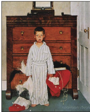
'The Discovery', 1956. Norman Rockwell's final cover (of 323) for The Saturday Evening Post .