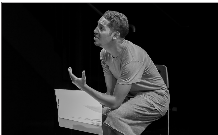
Out of the The Wings

Tuesday 30 July to Saturday 3 August Out of The Wings is a glorious opportunity to explore untapped translated theatre from the Spanish and Portuguese-speaking world. For full details and bookings go to omnibus-clapham.org , box office on 020 7498 4699 or call in at Omnibus Theatre, 1 Clapham Common North Side, SW4 0QW. Or why not sign up to the mailing list to get regular updates on all performances?