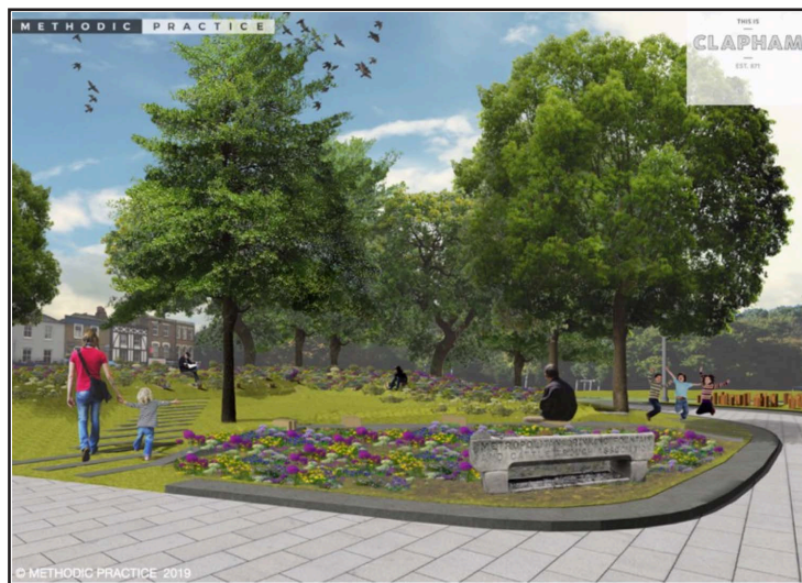
Grassy Knoll design proposal