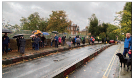
Bemasked, bothered and bewildered: Larkhall residents bemoan the closure of the bridge in October.

The sudden closure of Larkhall Rise Rail Bridge to vehicles by Lambeth Council on Friday 2 October took local residents by surprise. Larkhall Rise has likely been a Clapham public thoroughfare since the Domesday Book, hence the bridge when the railway cut through