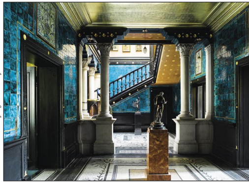
Narcissus Hall at Leighton House Museum

In the second half of the 19th century an extraordinary group of purpose-built studio houses was built on the edge of Holland Park. At their centre was the house built by Frederic Leighton, an inspiration to other artists who commissioned homes of their own. Combining domestic accommodation with studio space and space for entertaining, they provide fascinating insights into the wealth, status and taste of successful artists of the period.