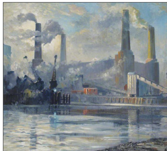
BAC Moving Museum: Wandsworth Collection

Digitisation is progressing, slowly (to see the range of paintings online, which includes Robert C D Lowry's