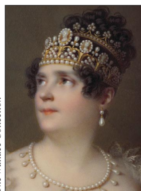
The Wallace Collection

Napoleon's Empress, Joséphine de Beauharnais, was a passionate gardener, book collector, patron and art collector. Her reputation in France and abroad for generosity, charm