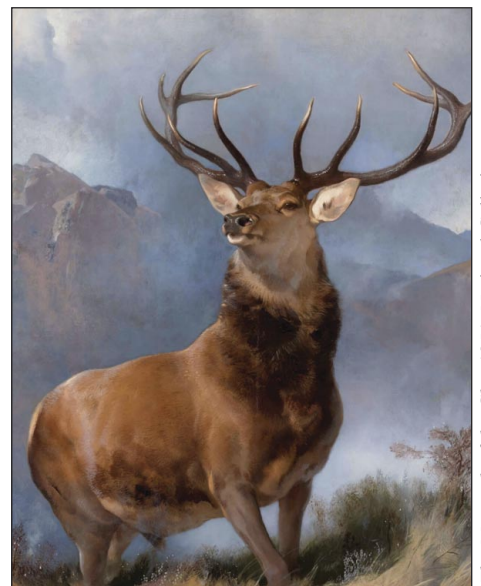
The Monarch of the Glen, 1851: National Galleries of Scotland, Edinburgh