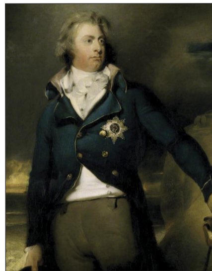
Duke of Clarence by Thomas Lawrence

If you can suggest how your street was named or want to find out more about it, please email history@claphamsociety.com .