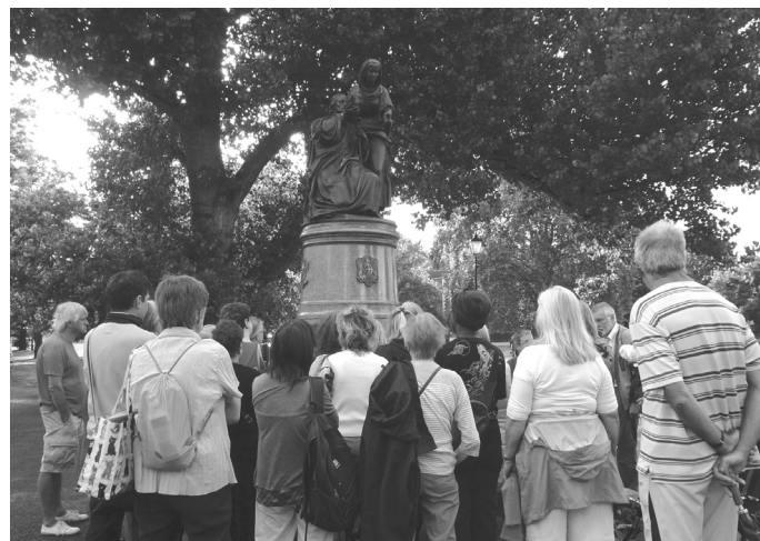
Learning the story of the Temperance Fountain on our July walk