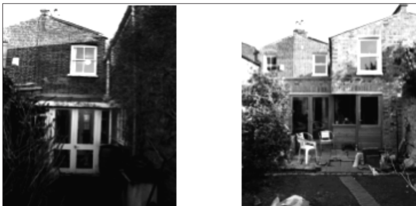
The rear view - before and after

So far, the Cobleys reckoned that their house was working well, and that their original objectives were generally being met. There would always be scope for improvement – further green measures in hand included increasing bio-diversity by planting more fruit trees and setting up a bee-hive – but even after a short time, it was clear that energy and water consumption had been significantly reduced while comfort and amenity had improved – and the 'before and after' photos of the frontage showed that this had been achieved at no detriment to its appearance.