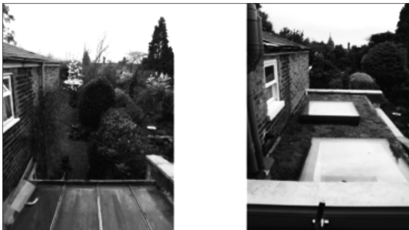
View from the first floor window - before and after

From the many questions that followed the talk, it was plain that members reckon they have a lot to learn from this very successful project.